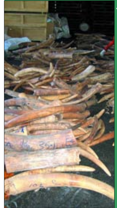
Part of an illegal consignment of 2.5 tonnes of ivory seized by Taiwanese authorities in July 2006 at Kaohsiung harbour. The ivory was en route from Tanzania to the Philippines. Two days later, a further 3 tonnes were seized at the same port.

Under Decision 13.26 , African Elephant range States are charged with demonstrating compliance with the requirements of Resolution Conf. 10.10 (Rev. CoP12) for internal trade in ivory. Legislation and law enforcement action to enforce such legislation is assessed. Countries which allow ivory markets to remain poorly regulated can be penalized with punitive sanctions under the Convention, including the suspension of all trade in CITES-listed specimens. Seventeen of the 37 African Elephant range States (Benin, Burkina Faso, Central African Republic, Chad, Congo, Equatorial Guinea, Eritrea,